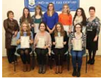
Outstanding Leaving Certificate award winners, 2014.