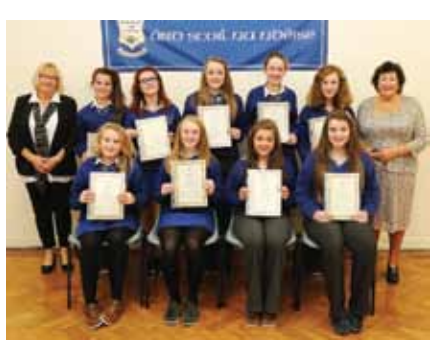
Students who excelled in the 2014 First Year Flocution examination